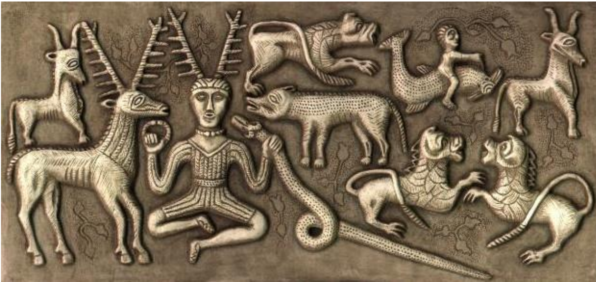
Panel showing the wheel-bearing god