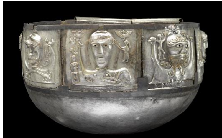
Panel showing an antlered god (Kernunnos?) wearing a torc, holding a torc and a snake